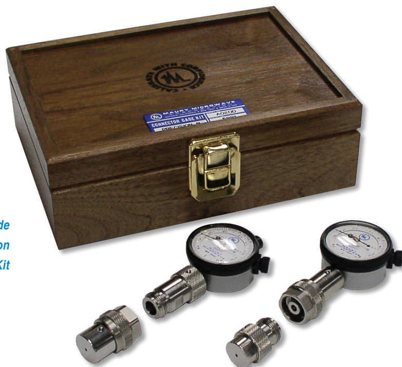
A020D Metrology-Grade Type N Precision Connector Gage Kit